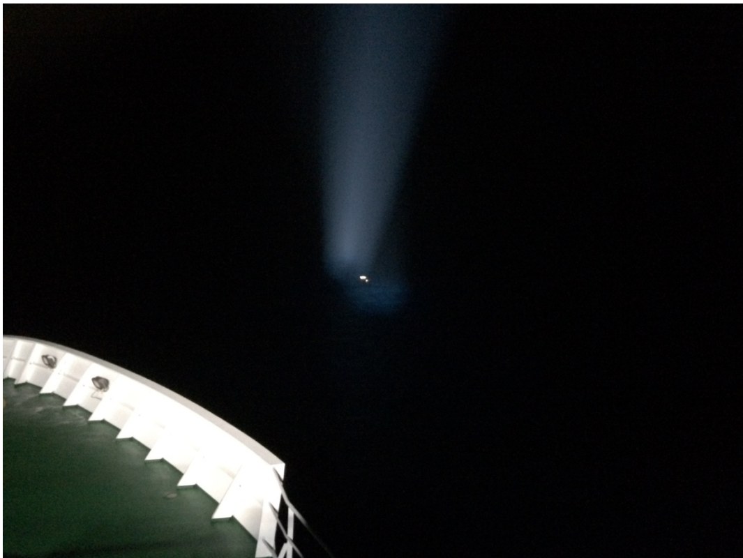
The little white dot is our OBS in the light beam.