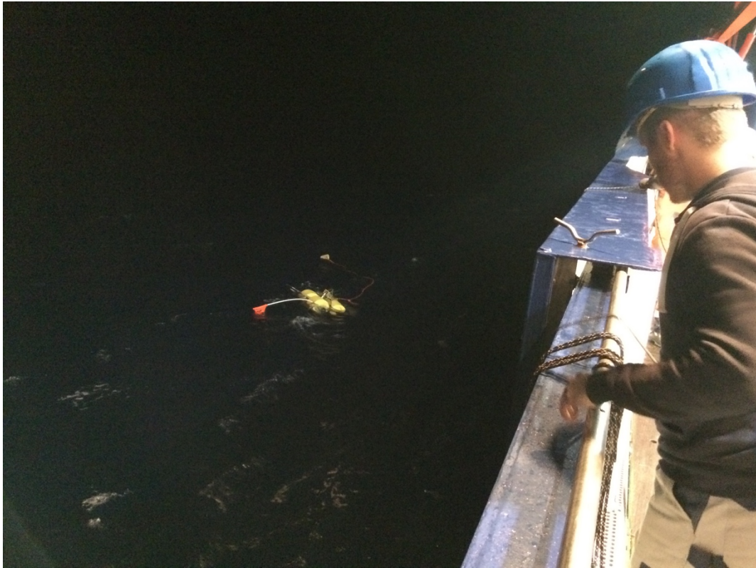
OBS waiting for its recovery on the starboard side of RV Maria S Merian.

And just like in the German soccer cup matches, at the end it is the quantum of luck that decides the match. In our case it was the very calm sea that was crucial to our success at night.